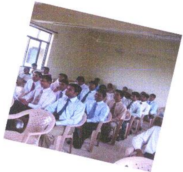
Photographs during session