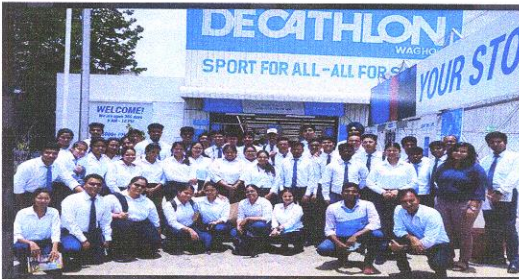
Photograph of visit

E-mail : enquiry@asma.in, director@asma.in Website : www.asma.in