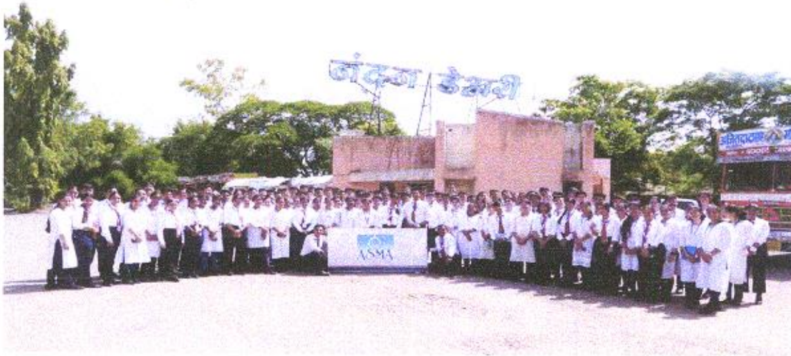
Snap During Visit.....

Nandan Dairy offered students valuable insights into processed milk and related products. Divided into groups, the students observed the pasteurization process and learned how raw milk is sourced. They also explored the manufacturing processes of milk products like curd and ghee, culminating in an exposure to the final packaging stages. The revelation that Nandan Dairy undertakes job work for major brands like Amul and Mother Dairy was a novel concept for the students. Overall, the visit provided terrific learning experiences and added immense value to their understanding of the dairy industry.