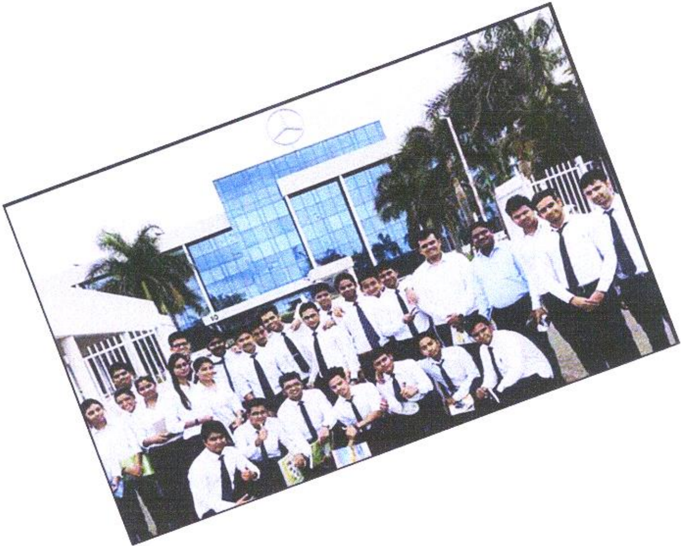
Photographs during Visit

E-mail : enquiry@asma.in, director@asma.in Website : www.asma.in