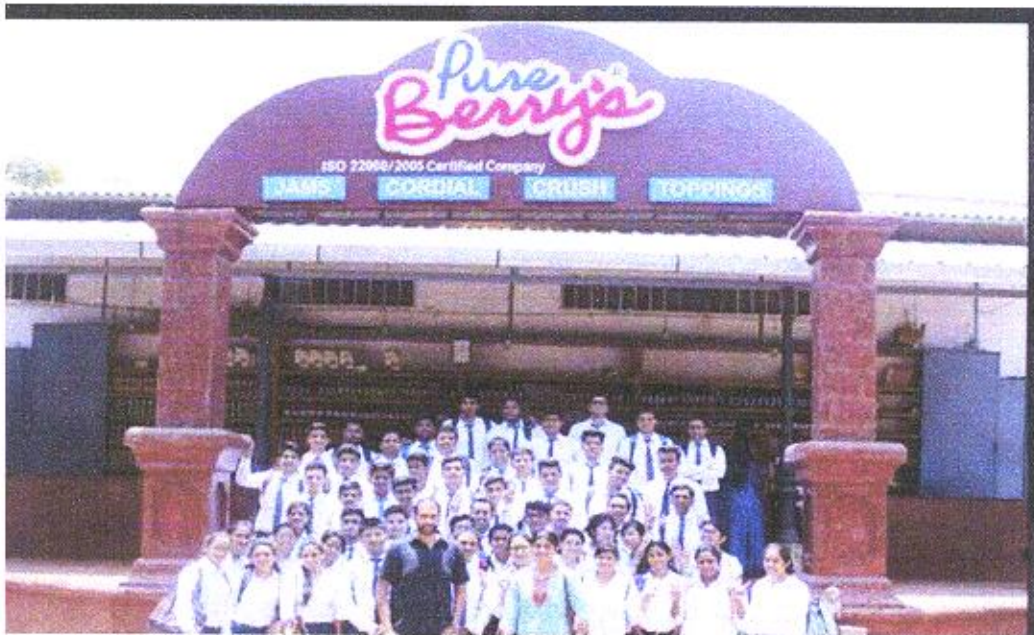
Photographs during Visit

E-mail : enquiry@asma.in, director@asma.in Website : www.asma.in